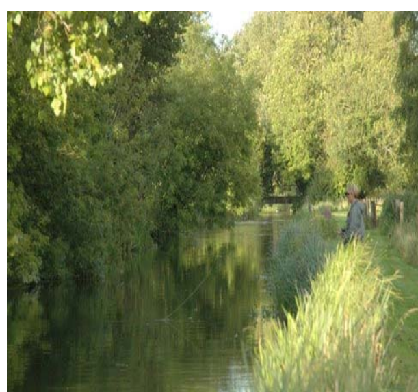
Straight section with concrete bridge in distance

At the end of the straight there is a high concrete bridge; cross over and fish on up to the end of the beat. This is the wading section of Priory beat.