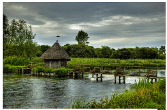
Leckford eel traps

The river rises in the village of Ashe, and flows west through the villages of Overton, Laverstoke, and the town of Whitchurch, before joining with the Bourne Rivulet at Testbourne and turning into a more southerly direction. It then flows through the villages of Longparish and Middleton to Wherwell and Chilbolton, where the Rivers Dever and Anton contribute to the flow.