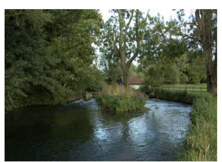
Sluice races and turbine hut

is wide and straight, one of the most favoured sections by the regulars.