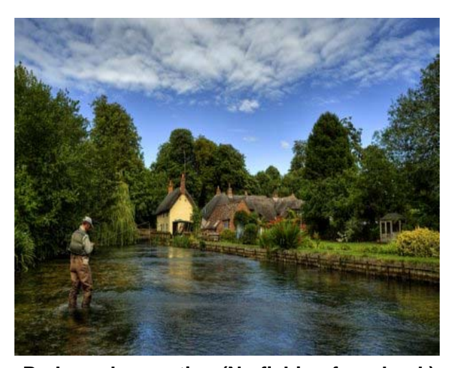
Park garden section (No fishing from bank)

As you get back to the garden section, please note that no fishing from the bank is permitted and please only two people in the garden at a time. However, you are very welcome to wade (see hatched area on map) and I can tell you that this is great for small, wild fish. Back on the concrete path, over the road and through the first garden (no fishing please) brings you back to the cabin. Here you have the option of fishing from the island; the pool at the top is fantastic.