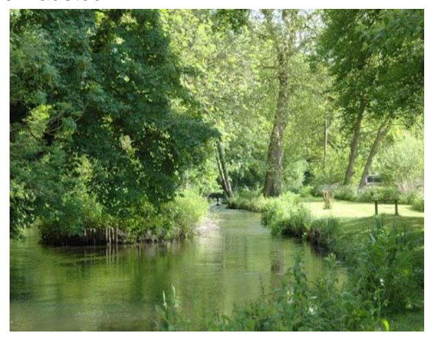
Second island with hatches beyond

Above the hatches is the final section to a red brick road bridge at which point you can go no further. I hope you are pleasantly exhausted.