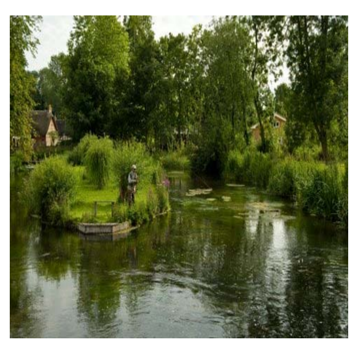
Island opposite Park cabin

Beyond the bridge (a good place to stand to spot fish) is the final section. Here is second island to fish from, with the chance to pick up some nice fish below the hatches.