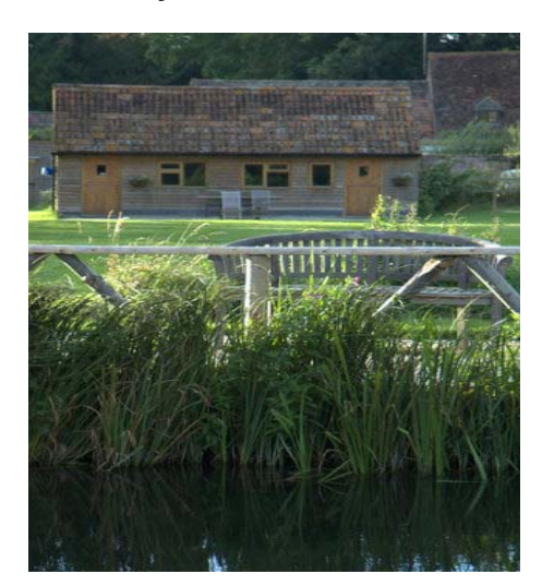
Priory cabin from river

The cabin is just slightly over half way up the beat; as you stand in front with the cabin to your back the river is at the end of the mown grass. The river keeper, Terry Snellgrove, has created a seating area by the river which is a good place to relax on a sunny day.