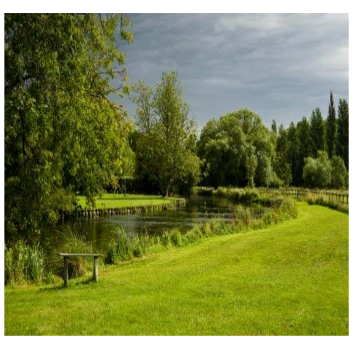
Lower section of Park beat

Make your way downstream through the garden (I know it is a bit disconcerting!) until the path narrows again and you come to hatches and a pool. Keep left to follow the left bank to another gate. Cross another road (these are all private estate roads) and